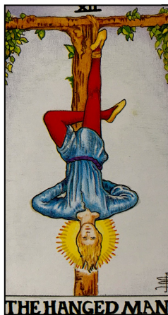
THE HANGED MAN